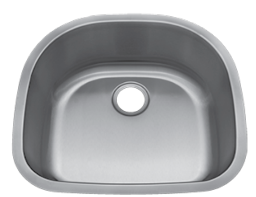
--- Dimensions ---Outer 23-1/4" x 20-7/8" x 9" Inner 21-1/4" x 18-7/8" x 9"