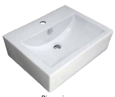
Dimensions Outer: 20-1/8" x 16-1/8" x 6-1/2" Inner: 17-1/8" x 9-5/8" x 4-3/4"