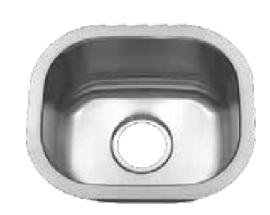
--- Dimensions ---Outer 14-3/4" x 12-3/4" x 7" Inner 12-1/2" x 10-3/4" x 7"